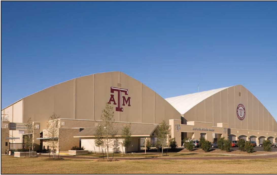
McFerrin Athletic Center College Station, TX