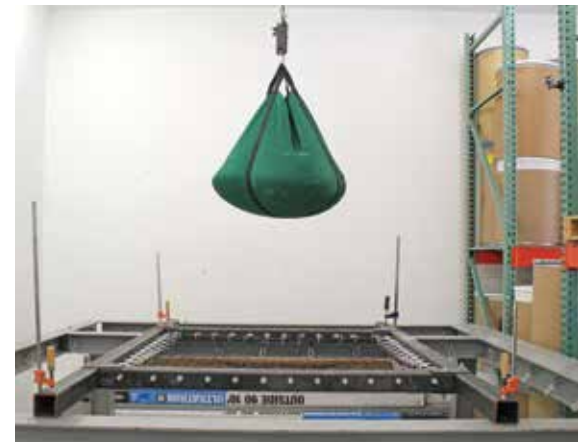
ASTM F2375-09 Class Two (250 lb) drop test