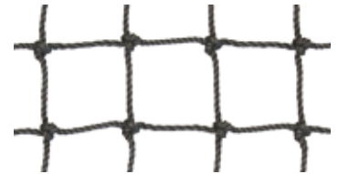
Under-Bed Netting PSN HD 2-1/2 inch Nylon